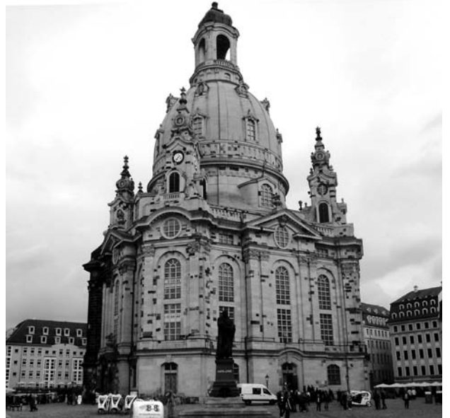
This page, Clockwise from top: The Reformation Church and Town Hall, Wittenberg; Frauenkirche, Dresden; Sans Souci Palace, Potsdam; The Wends Tower, Bautzen. Page 4: Mendelsohn Memorial, Leipzig.

named after famous figures including Bach, Goethe, Kandinsky, Lizst, Schiller, Wagner, L.Cranach the Elder, Gropius, Herder, Hummel, Klee and Nietzsche. The “Jakobskirche” (Church of St. Jacob) dates back to 1168 and the “Herderkirche” to 1245. Luther had strong connections with these two churches. One museum holds a Luther Bible (1534).