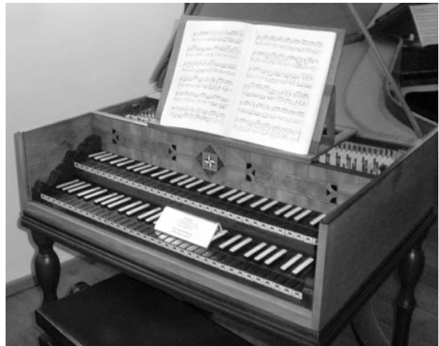
Harpsichord with double keyboard, Bach Museum, Eisenach.

Eisenach was just inside what was known as “The Iron Curtain”. A guided tour of Wartburg Castle revealed much. Built in the 11th century, it was constructed of 40,000 tonnes of sandstone, and is three storeys high. Walls are six feet thick in the cellar and four feet thick in the other rooms. The “sleeping room” for ladies has four million pieces of coloured stones and glass. The chapel was built in 1320. In 1521 Martin Luther lived at Wartburg Castle under the Protection of King Frederick the Wise of Saxony,