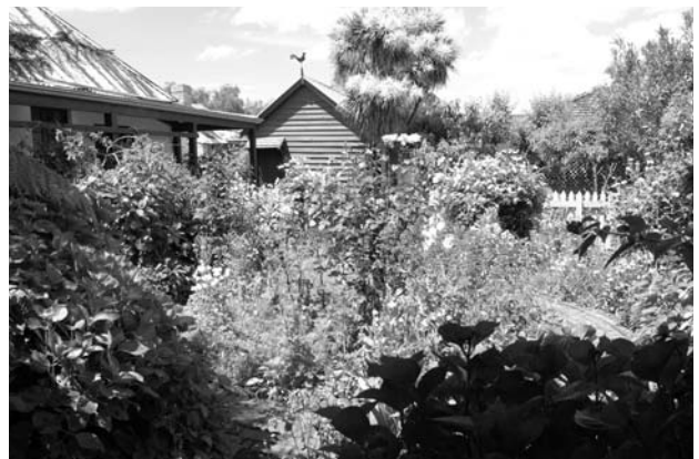
Top: Ziebell's Farmhouse