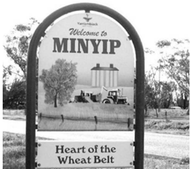
Clockwise, from top: Lutheran Church, Warracknabeal; Nuske headstone at Katyip; Cemetery near Warracknabeal; Minyip town sign; Lutheran Church, Minyip.