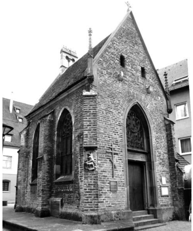
Top: Town Hall with Cathedral at rear, Ulm