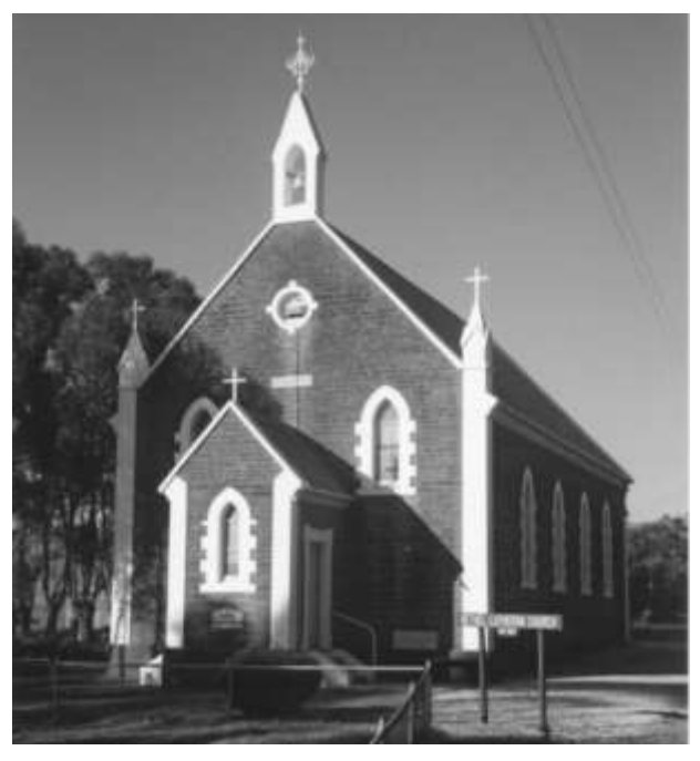
Bethel Lutheran church

...The author then points out that some of the Moravian Brethren were growing tired of financially supporting those commune members less fortunate or industrious. They also felt that the preaching of the new Lutheran pastor was going over their heads.