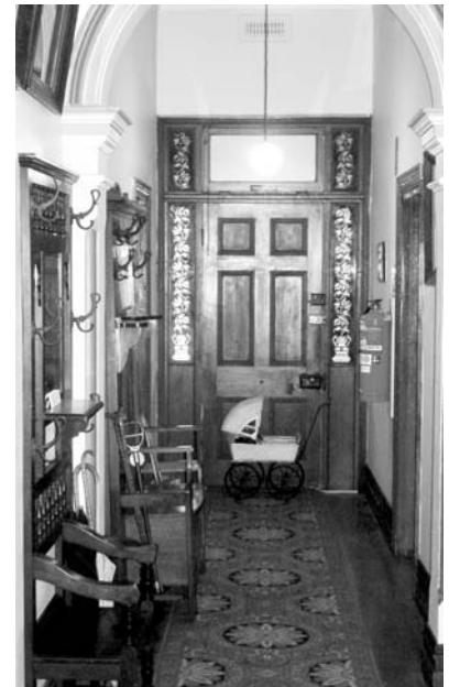
Clockwise: Ambleside Park Homestead, Ambleside interior, Glen Turnbull at Ferntree Gully Cemetery.