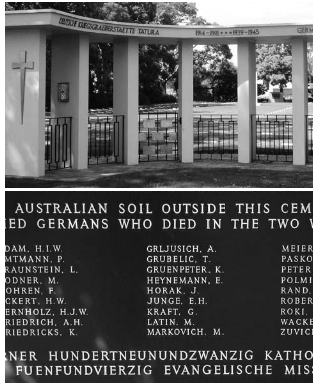
Entrance and plaque at the German War Cemetery, Tatura.