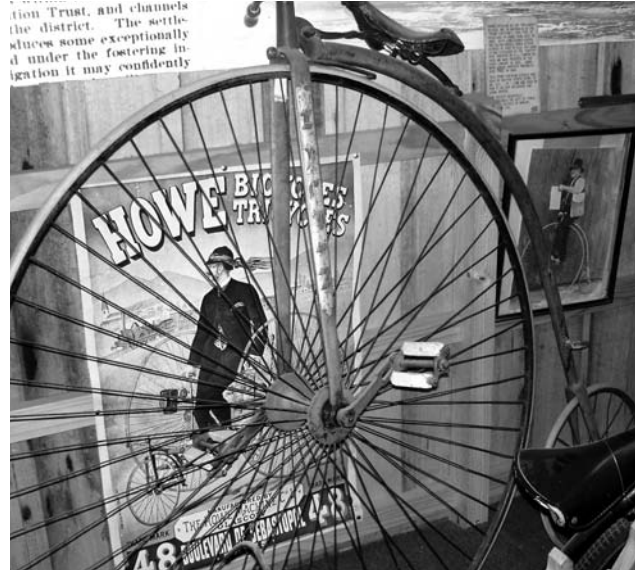
Shepparton Museum (photo used with permission).