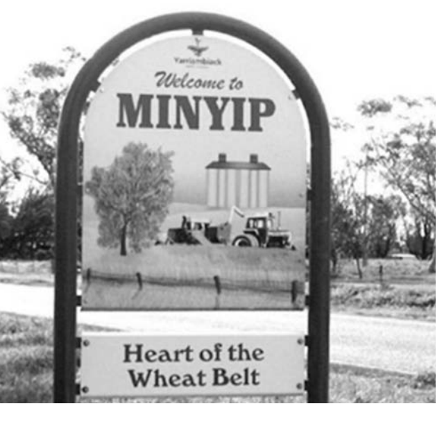
Clockwise, from top: Lutheran Church, Warracknabeal; Nuske headstone at Katyil; Cemetery near Warracknabeal; Minyip town sign; Lutheran Church, Minyip.