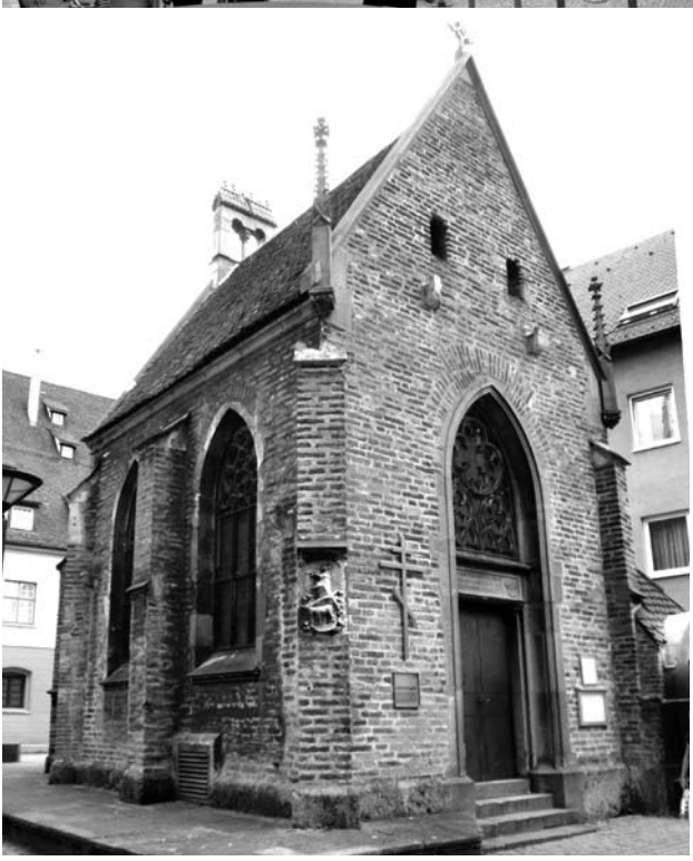
Top: Town Hall with Cathedral at rear, Ulm Bottom: Valentine's Chapel, Ulm

It is a massive undertaking much appreciated by the hundreds of audience members. Our accommodation was at nearby Ettal. We visited the church there and admired its ornate interior. Some of the tour group attended a service the next day at a Lutheran church, The Church of the Holy Cross, in Oberammergau.