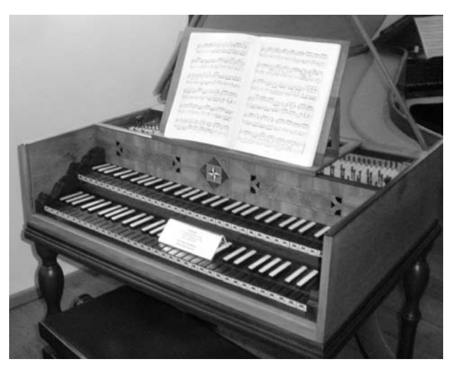
Harpsichord with double keyboard, Bach Museum, Eisenach.

Eisenach was just inside what was known as "The Iron Curtain". A guided tour of Wartburg Castle revealed much. Built in the 11th century, it was constructed of 40,000 tonnes of sandstone, and is three storeys high. Walls are six feet thick in the cellar and four feet thick in the other rooms. The "sleeping room" for ladies has four million pieces of coloured stones and glass. The chapel was built in 1320. In 1521 Martin Luther lived at Wartburg Castle under the Protection of King Frederick the Wise of Saxony,