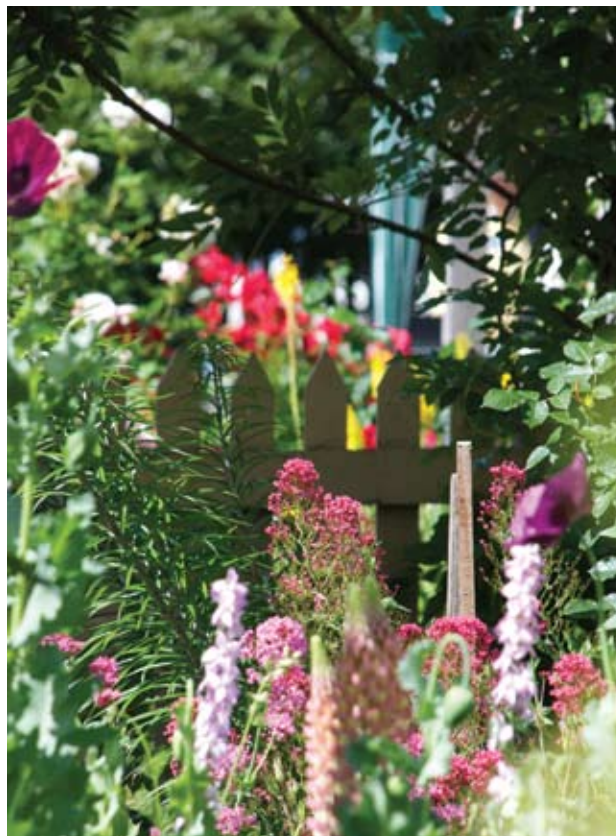
Right: Ziebell's Farmhouse Garden