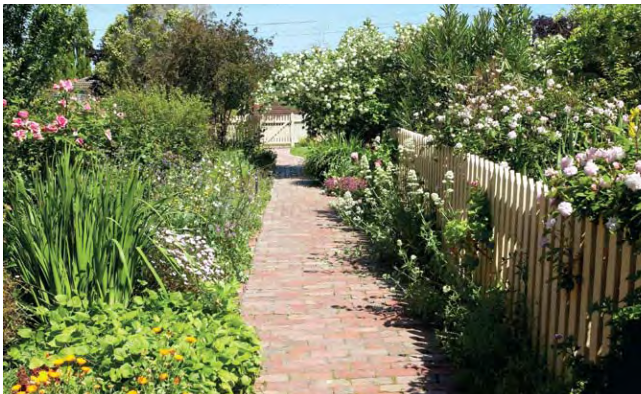
Ziebell's Farmhouse Garden and St David's Lutheran Church, Freshwater Creek.

The venue is the Ivanhoe Lutheran Church, 27 Livingstone St, Ivanhoe, Vic. (Melway 31 E7). Please bring some finger food for lunch. All are welcome.