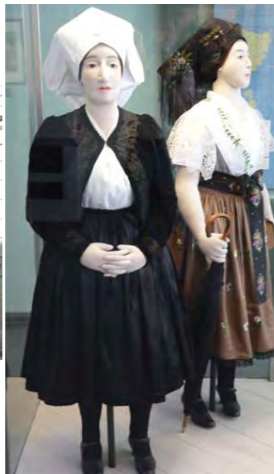
Clockwise from Above: The façade of the Wendish Museum; Display of Wendish dress, Wendish Museum; Cottbus old town; City Square, Cottbus; A view of the exterior of the church in Klepsk; The player's console of the smaller Silbermann organ in Freiberg Cathedral; Portrait of a group of Wendish Weavers, Wendish Museum.