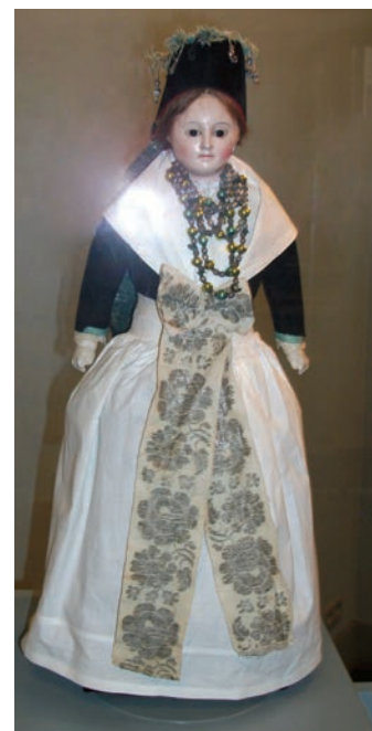
Doll in Wendish dress