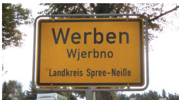
Top: Werben Lutheran Church