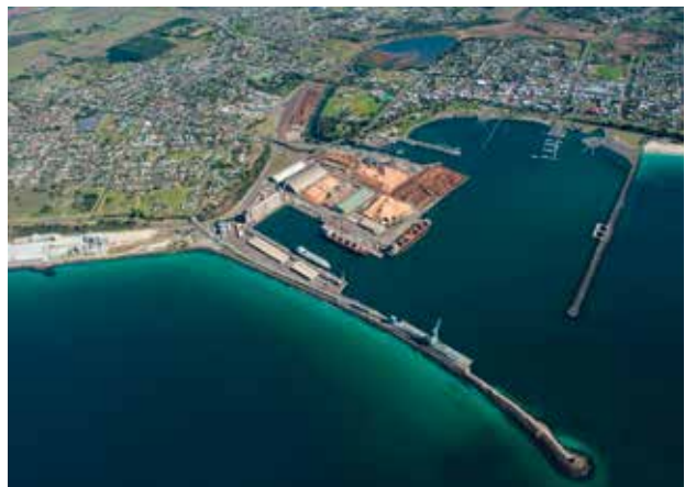
An aerial view of Portland, Victoria.

Please book by 28 Feb. with Betty Huf, PO Box 26, Tarrington, Vic. 3301; Telephone (03) 5572 4959; email bettyhuf@westvic.com.au as bookings are desirable for some venues.