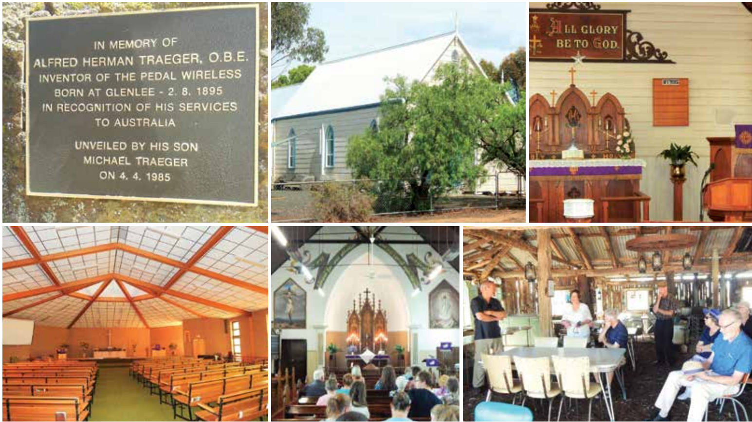
Top row, left to right: 1. Memorial plaque to Alfred Traeger at Glenlee. 2. Woorak Lutheran Church. 3. Interior of Woorak Lutheran Church. Bottom row, left to right: 1. Interior of Dimboola Lutheran Church 2. Sunday Worship at Jeparit Lutheran Church. 3. Tour participants relaxing in the Kumbala Native Garden log shed.

worked with John Flynn, founder of the Flying Doctor Service, and invented the now famous pedal wireless which created a communications revolution by enabling those in the remote areas of Australia to have access to School of the Air, doctors, hospitals, and any other services that they required. Traeger's affordable and easily operated pedal radios were also used internationally in countries as diverse as Canada and Nigeria.