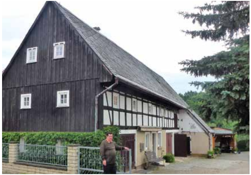
Geoff Saegenschmitter in front of the Zwar ancestral home in Drehsa.

She also drove us to many small villages in the Bautzen area. Farmers experienced an exceptional