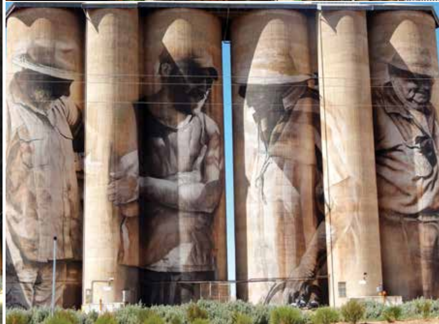
Clockwise from main: 1. Interior of Murtoa's Stick Shed. 2. Vintage household utensils in Woods' Farming and Heritage Museum, Rupanyup. 3. Silo art at Brim depicting four characters, typical of hardy country people of the Wimmera-Mallee.

Murtoa, which means “home of the lizard” then provided four interesting features for inspection. The Murtoa Cemetery was the last resting place of the ancestors or relatives of some participants and Richard Krelle was able to answer the usual sort of questions when they were raised, such as “Where is [name supplied] buried?” or “Is [name supplied] buried here?”