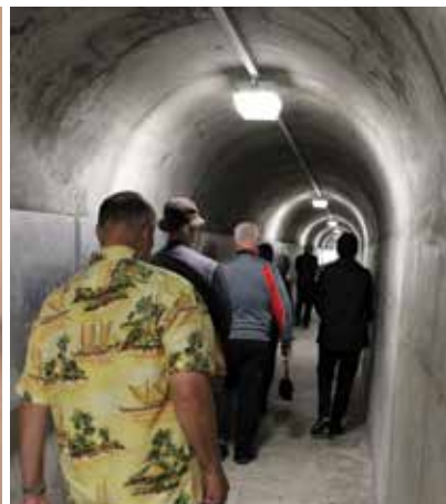
1. "Dingley Dell", Adam Lindsay Gordon's cottage near Port MacDonnell, S.A. 2. Adam Lindsay Gordon (1833–1870). 3. Our Tour group walking through a tunnel at the Blue Lake Pumping Station.

9. Adam Lindsay Gordon came to Australia from England in 1853 and became known as a creative poet and a competent, but cavalier, horseman. He is renowned for his feat of leaping on horseback over an old post and rail guard fence onto a narrow ledge overlooking Blue Lake, and then jumping back onto the roadway. The site of this daring riding feat is known as "Gordon's Leap". It is marked by an obelisk in memory of Adam Lindsay Gordon.