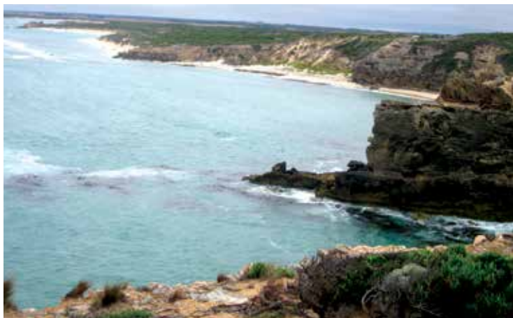
Rugged coastline at Port MacDonnell, S.A.