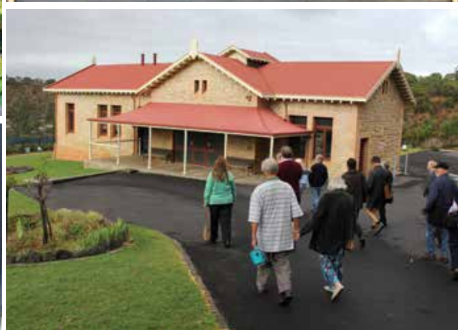
Clockwise from top left: 1. Umpherston Sinkhole or “sunken garden”. 2. Meischel Park plaque. 3. Our Tour group at Blue Lake Pumping Station. 4. Meischel Park Cemetery plaque.

4. The Umpherston Sinkhole or “sunken garden” was a part of the property of James Umpherston, who settled in this area in 1860. By 1884, he had developed this Sinkhole into a pleasant resort for his family and also for the townspeople of Mount Gambier. Sinkholes appear when rainwater, which absorbs carbon dioxide from decaying vegetation, then forms into carbonic acid, which soaks into and dissolves the limestone’s calcite or calcium carbonate below the surface. When the underlying limestone eventually collapses, a large sinkhole appears.