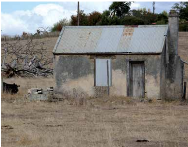
1. Early settler's limestone cottage, home of the Hirth family, Mount Gambier. 2. Replica of the brig "HMS Lady Nelson" at the Mount Gambier Visitor Centre.